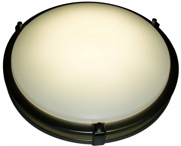
Figure 8. Operational indoor wall pack fixture

The indoor wall pack design required no secondary optics to be mounted on the individual LEDs. The spacing of the LEDs and the use of a diffuser cover over the LED array were sufficient in producing the desired light output. Figure 8 shows an operational indoor wall pack fixture with the diffuser cover on.